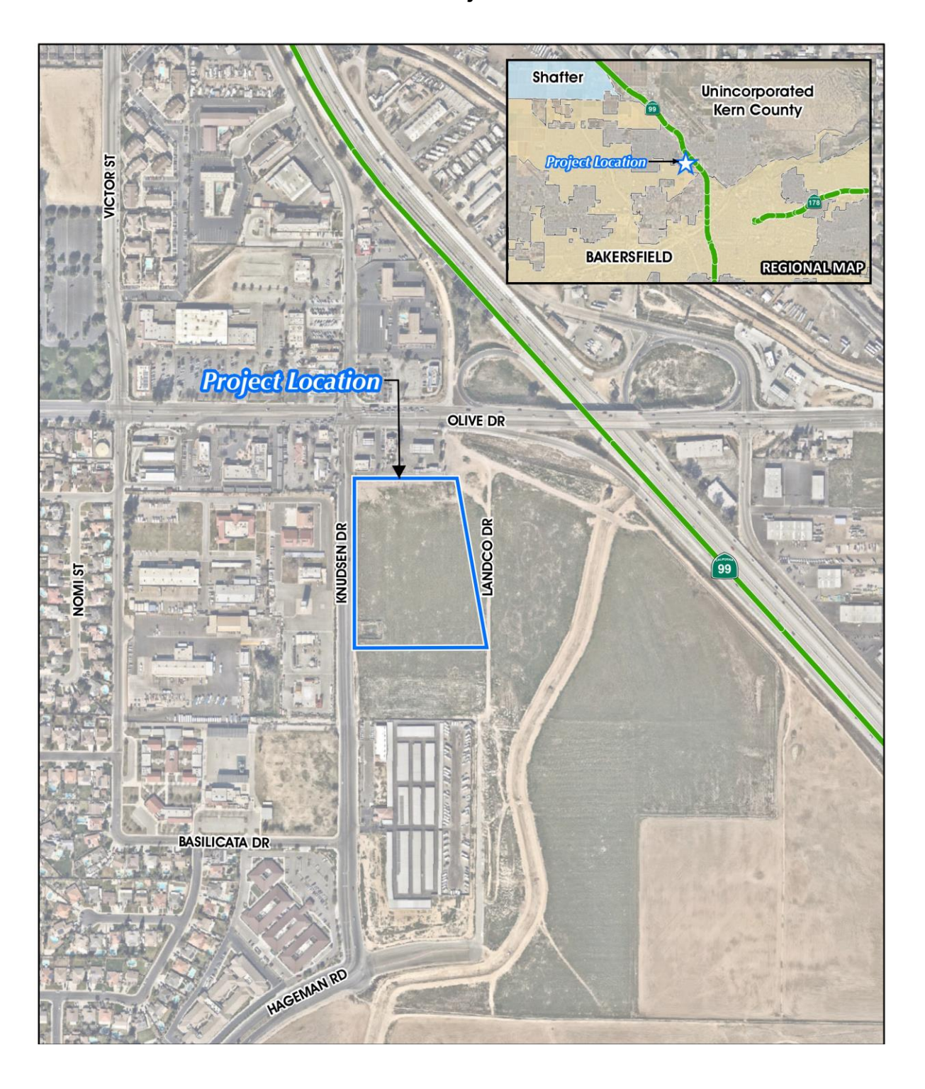
Exhibit 1. Project Location