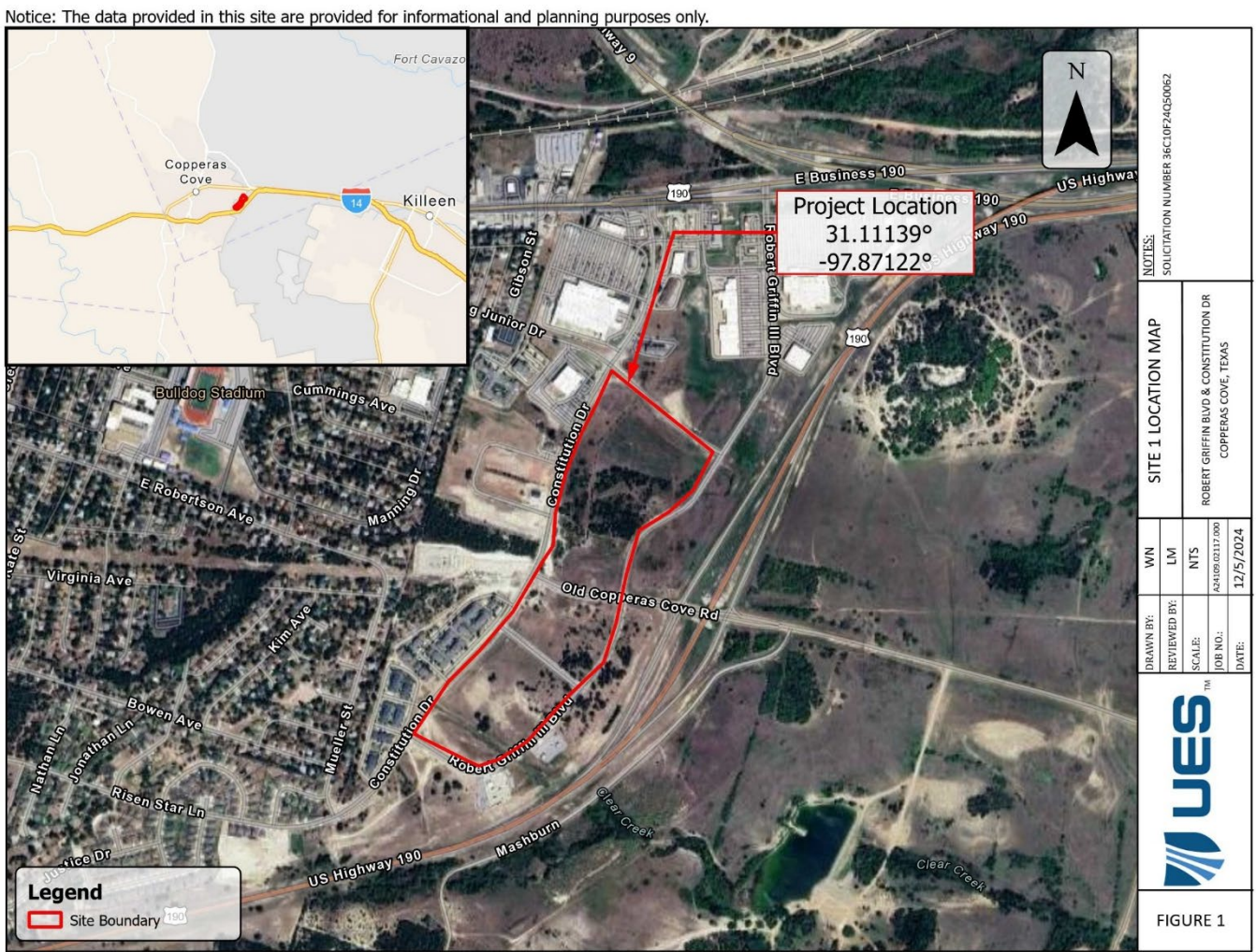
Figure 1. Proposed Location for a VA Outpatient Clinic – Site Vicinity Map

(5) OpenStreetNap (end) contributors, CC-BY-SA, Texas Parks & Wildlife, CDMANP, Esri, TomTom, Garmin, SafeGraph, FAO, METI/INASA, USGS, EPA, NPS, USFWS, Esri Community M Contributors, Texas Parks & Wildlife, CDMANP, Esri, TomTom, Garmin, SafeGraph, GeoTechnologies, Inc., METI/INASA, USGS, EPA, NPS, US Consus Bureau, USDA, USFWS, Mariar