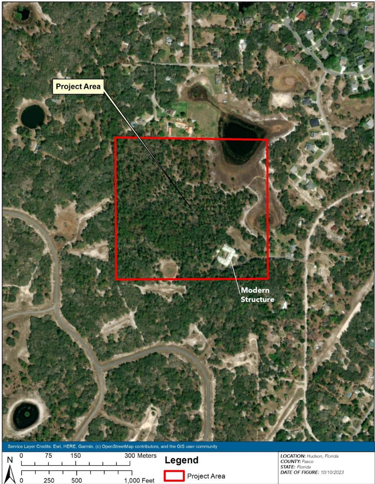
Figure 2. Aerial imagery of the proposed project area showing the modern structure