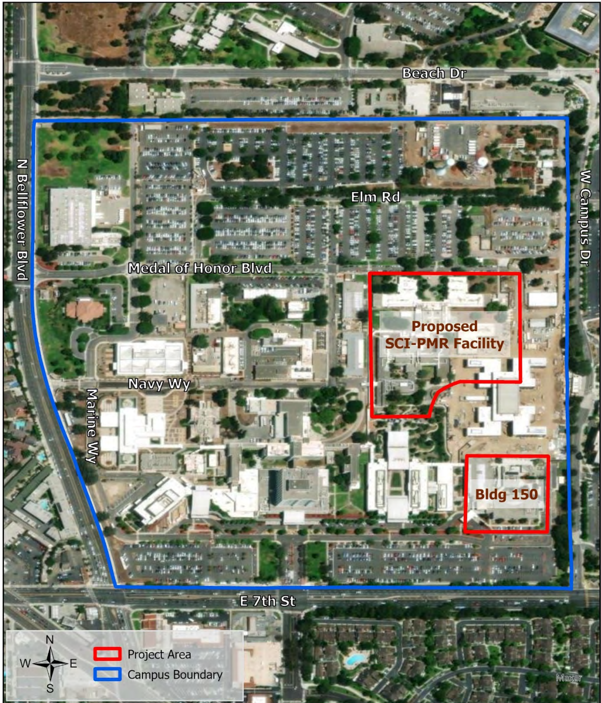
Figure 2. Location of the Proposed SCI-PMR Project (red polygons)