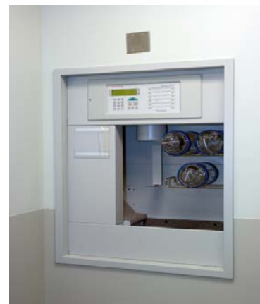
Example of typical pneumatic tube station

Pneumatic tube systems may be incorporated into VA Medical Facilities as an efficient method of transporting medications, laboratory samples, etc. from various locations within the facility such as the pharmacy to the patient care unit or the patient care unit to the laboratory. The pneumatic tube system is composed of carriers, tubes, blowers, stations, diverters and a computer control center, pneumatic tube delivery systems are designed for the high-speed, cost-effective transport of small materials weighing up to 6 lbs.