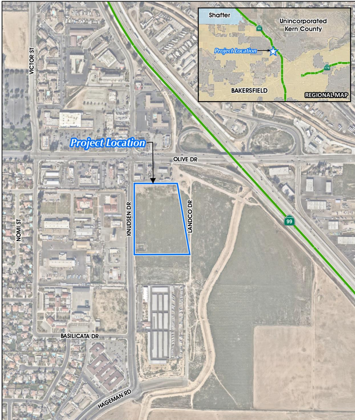
Exhibit 1. Project Location